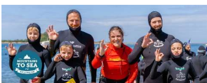
COMMUNITY SNORKELS Greater Wellington Water Safety

Beginners welcome! We provide all the necessary gear and experienced guides to ensure your safety and enjoyment in the water. Participants just need to be at least eight years old and confident swimmers. Those under sixteen must be accompanied by an adult.