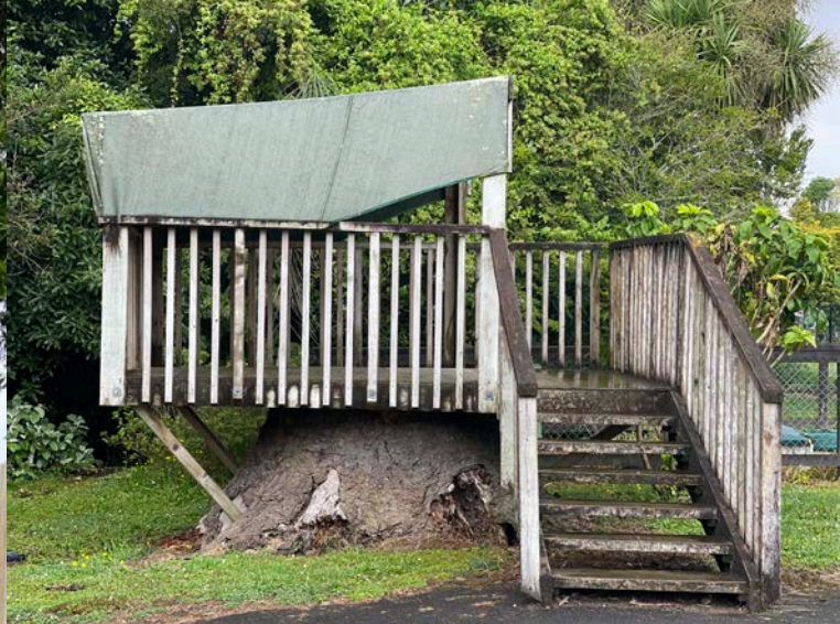
^ Lookout Hut