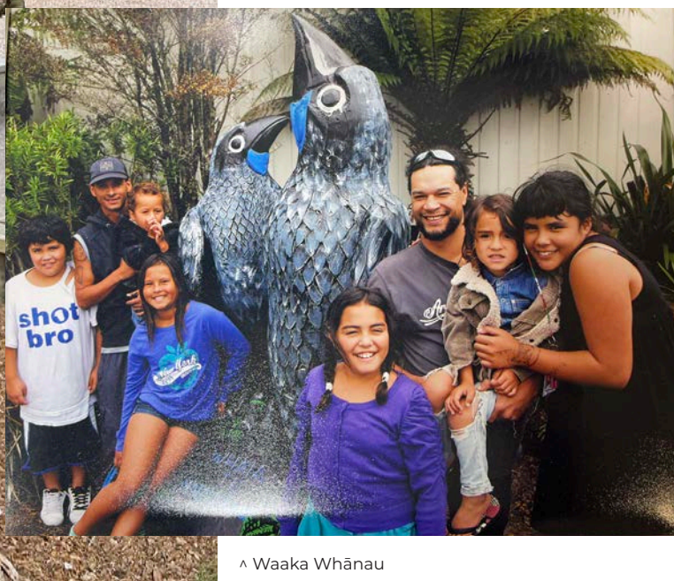
^ Waaka Whānau